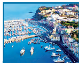
1. MARINA GRANDE