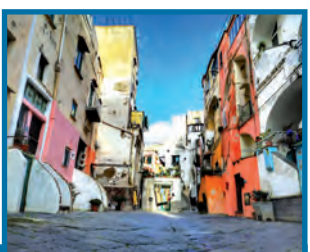
6. CASALE VASCELLO

Published by carte guide per You Know | © Cart&guide