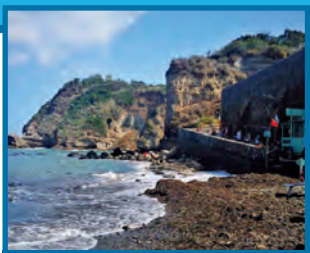
11. POZZO VECCHIO