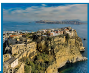
4. TERRA MURATA