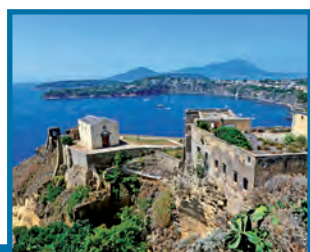
5. SANTA MARGHERITA