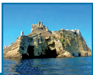
3. PALAZZO D' AVALOS