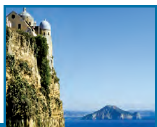
2. ABBAZIA DI SAN MICHELE