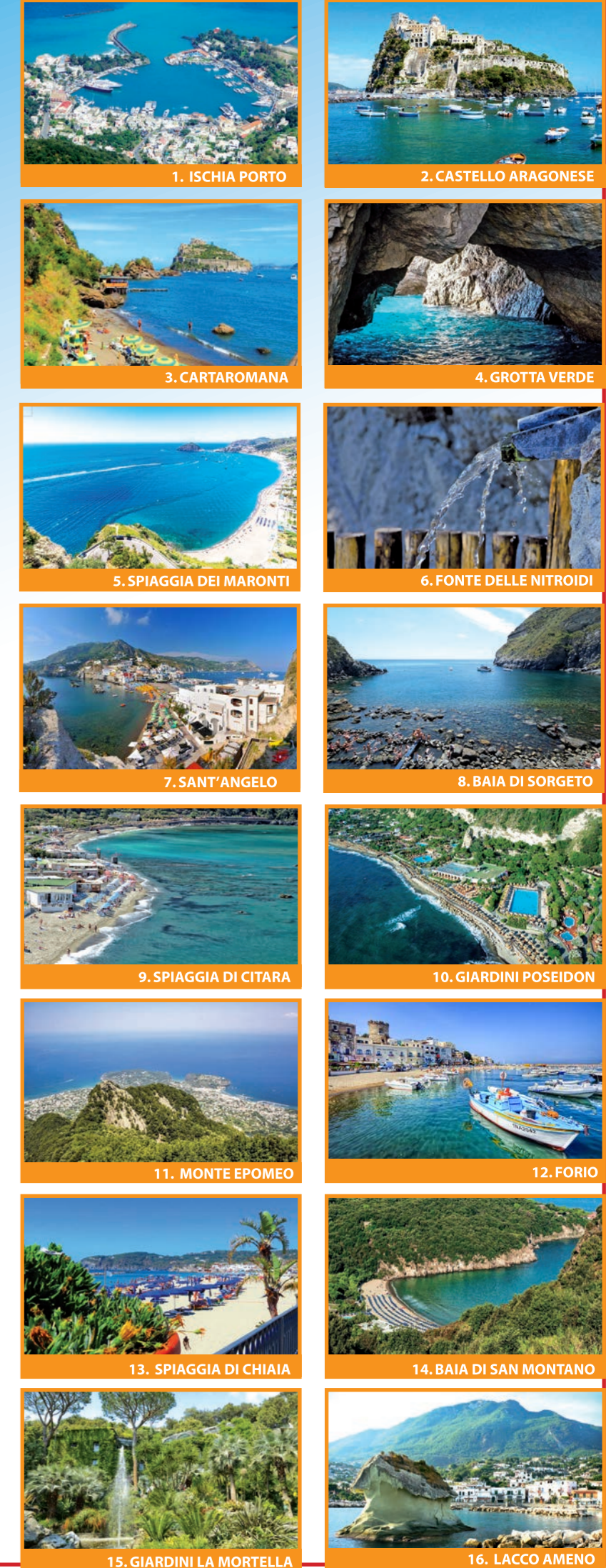
1. ISCHIA PORTO